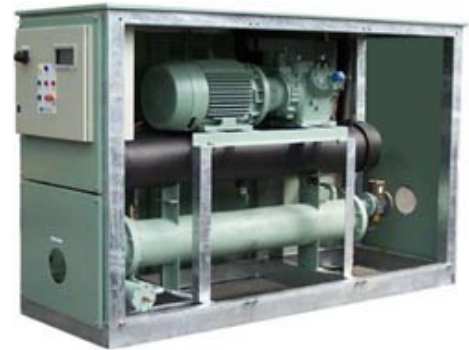
Unit Maintenance Access

This compact universal controller incorporates an LCD text display and an operator interface for operation and performance monitoring and diagnosis. It also provides an extensive logging facility to continuously gather a detailed operating history for service and maintenance purposes.