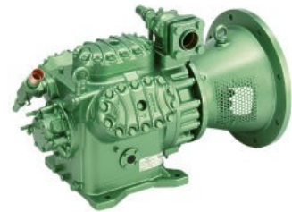
Open Drive Compressor